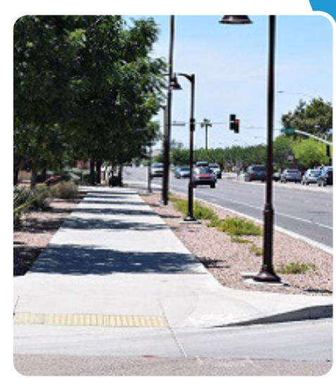
Examples of potential SR2T improvements such as enhanced pedestrian crossings and improved sidewalk connections